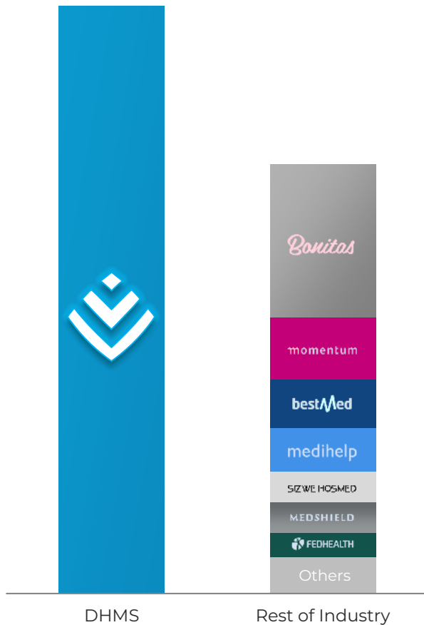
Membership and market share as at June 2023