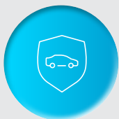
Stolen and recovered vehicle*

*The benefit offers counselling when an incident has caused a traumatic experience for you or your family.