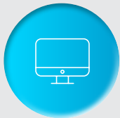
Theft or attempted theft*