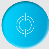
Hijack or attempted hijack