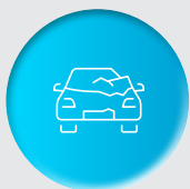
Car accident involving a fatality