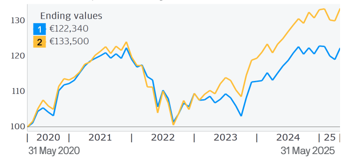
Growth of EUR 100,000 Calendar years